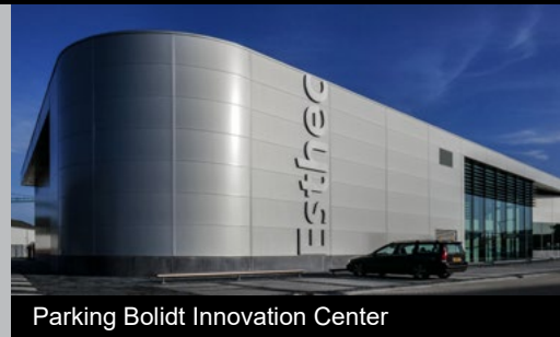
Parking Bolidt Innovation Center