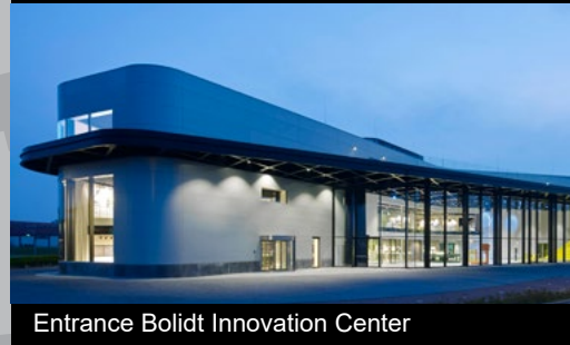
Entrance Bolidt Innovation Center